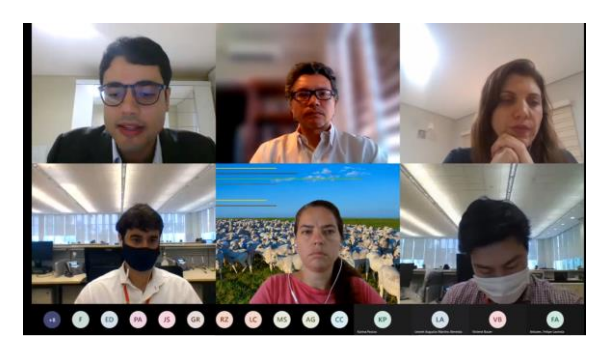
Figure 1 – Opening screen of webinar