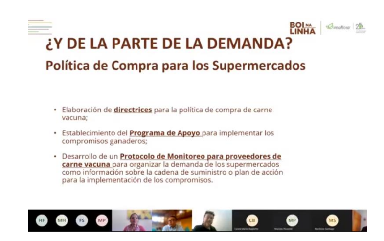
Figure 11 - Presentation of next steps, engaging supermarkets