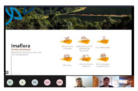
Figure 2 - Imaflora presentation

In turn, FVS gave an overview of the deforestation and conversion situation in the Gran Chaco region of Argentina over the past 45 years, by presenting: