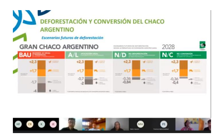
Figure 4 - Study of Trends in regard to deforestation

becomes more restricted, the maintenance of biodiversity and reduction in emissions increases<sup>1</sup>.