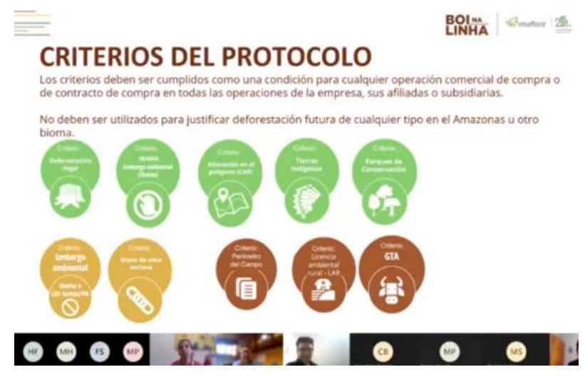
Figure 10 - Criteria considered within the Monitoring and Verification Protocol

In the final topic raised, Imaflora presented within the Beef on Track Program a few next steps involving engagement with other sectors that work with meatpackers, such as supermarkets, which Imaflora is supporting with guidelines on how to build a beef purchase policy and also how to implement this policy so it can be monitored in the chain.