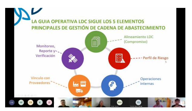
Figure 6 - The elements of the Deforestation and Conversion-Free Operational Guide

After presenting the Accountability Framework (AFi) and the Deforestation and Conversion-Free Operational Guide, FVS presented the current state of monitoring, reporting and verification in Argentina, describing the progress and also the existing challenges.