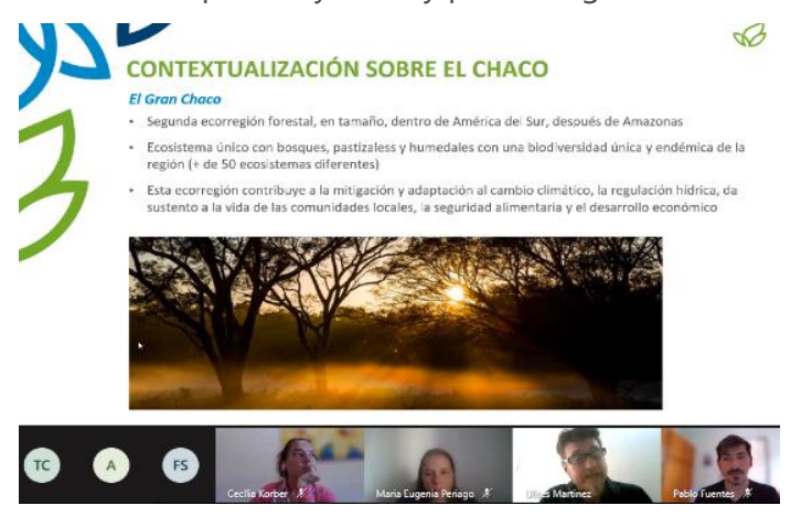
Figure 3 – Contextualising the Chaco

In turn, FVS gave an overview of the deforestation and conversion situation in the Gran Chaco region of Argentina over the past 45 years, by presenting: